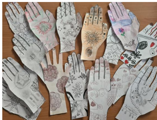
Designed by Year 4

In school, the children have settled back into their studies. We had a visit from two of our Trustees on Wednesday who were delighted with the activities taking place around the school and commented on the impeccably behaved children that were so well engaged in their learning in the classrooms that they visited. The highlight of our tour were seeing children in Year 1 learning how to take away using cubes and diagrams, children in Year 3 practising their times tables really confidently and pupils in Year 5 challenging themselves to improve their writing.