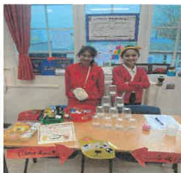
Year 6 team